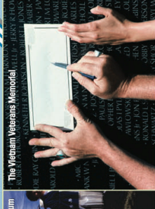
The Vietnam Veterans Memorial