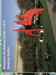
Relaxing in the National Gallery of Art's Sculpture Garden