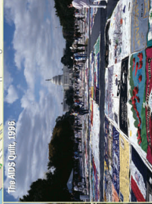
The AIDS Quilt, 1996