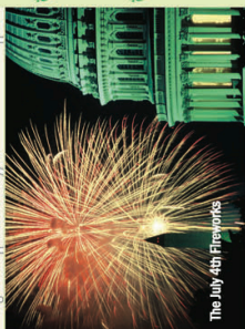
The July 4th Fireworks

FDR's dog Fala at the FDR Memorial. These words from the Declaration of Independence inscribed at the Jefferson Memorial: "We hold these truths to be self-evident that all men are created equal."