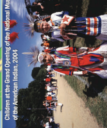
Children at the Grand Opening of the National Museum of the American Indian, 2004