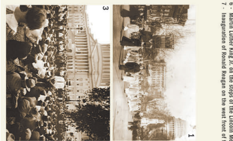
1 - Suffragists Parade on Pennsylvania Avenue, 1913

The Mall also became the nation's world-renowned site for declaring and demonstrating that all Americans are entitled to equal rights. In 1939