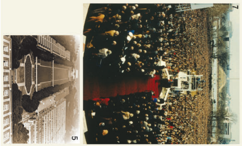
7 - Inauguration of Ronald Reagan on the west front of the U.S. Capitol, January 20, 1981

nation. Sites were needed for new memorials, public buildings, and parkland.