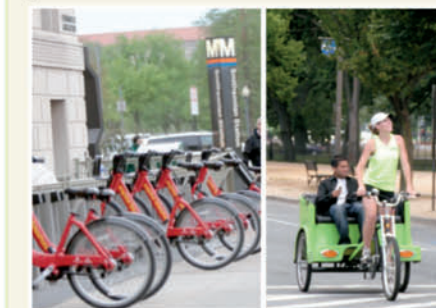
PHOTO CREDITS - Front Cover: Celebrating July 4th On The Mall, c. 1990, by Tom Wachs - Back Cover: Aerial View Of The National Mall, by Carol Highsmith - 1, 3, 5, 7: Library of Congress, Prints & Photographs Division - 2: National Photo Company Collection, Library of Congress - 4: National Archives, Still Pictures Division, Photo Time-Life - 6: AP/Wide World Photos - Map Side: Tom Wachs and Carol Highsmith.

GETTING AROUND THE MALL today should be easier than it is. The two-mile-long distance from the Capitol to the Lincoln Memorial can be a challenge for pedestrians. Options today include Capital Bikeshare with several Mall locations near Metro stops, and pedicabs. These modes help make the Mall a more sustainable place.