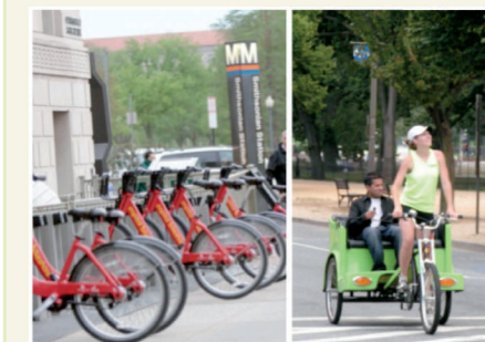
PHOTO CREDITS - Front Cover: Celebrating July 4th On The Mall, c. 1990, by Tom Wachs - Back Cover: Aerial View Of The National Mall, by Carol Highsmith - 1, 3, 5, 7: Library of Congress, Prints & Photographs Division - 2: National Photo Company Collection, Library of Congress - 4: National Archives, Still Pictures Division, Photo Time-Life - 6: AP/Wide World Photos - Map Side: Tom Wachs and Carol Highsmith.

will be easier starting Spring 2015 with the new, low-cost National Mall Circulator bus service. Other options include Capital Bikeshare with several Mall locations near Metro stops, and pedicabs. These modes help make the Mall a more sustainable place.