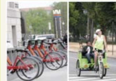
PHOTO CREDITS - Front Cover: Celebrating July 4th On The Mall, c. 1990, by Tom Wachs - Back Cover: Aerial View Of The National Mall, by Carol Highsmith - 1, 3, 5, 7: Library of Congress, Prints & Photographs Division - 2: National Photo Company Collection, Library of Congress - 4: National Archives, Still Pictures Division, Photo Time-Life - 6: AP/Wide World Photos - Map Side: Tom Wachs and Carol Highsmith.

will be easier starting Spring 2015 with the new, low-cost National Mall Circulator bus service. Other options include Capital Bikeshare with several Mall locations near Metro stops, and pedicabs. These modes help make the Mall a more sustainable place.