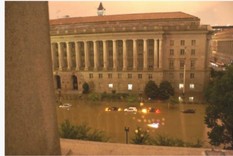
This June 2006 rainstorm caused devastating flooding to Mall area museums and public buildings. The threat is predicted to increase and intensify with climate change. But government is not responding, so the National Mall Coalition proposed a creative solution with the National Mall Underground.

The National Mall Coalition has been working to fill this gap in long-range planning by engaging the public in brainstorming and proposing innovation solutions . Read more here .