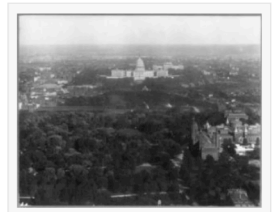
This 1900 photo shows the Mall covered in trees and a train (see the white puffs) crossing on tracks in front of the Capitol. The original visionary L’Enfant Plan had been ignored and the new McMillan Plan would soon restore and expand L’Enfant’s vision for the Mall. CLICK to enlarge

The idea and design for the Mall originated in the 1791 L’Enfant Plan for the nation’s capital. That Plan, together with the 1902 McMillan Plan that updated and enlarged L’Enfant’s vision, remains today the historical blueprint for the capital and its centerpiece, the National Mall. Explore these plans in greater detail in Resources .