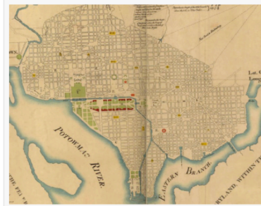
1791 L’Enfant Plan for the City of Washington. The Mall (green) was the symbolic heart of the L’Enfant’s plan for the capital.

President George Washington in 1791 commissioned Peter (Pierre)* L’Enfant, a Frenchman and engineer who had served under Washington during the American Revolution, to draw up a plan for the new seat of government for the United States. L’Enfant laid out the capital as a geographical embodiment of the newly ratified U.S. Constitution. The Capitol Building would be located on the highest spot, Jenkins Hill. The President’s House would occupy another hill a mile away. The centerpiece of L’Enfant’s vision was the Mall (area in green) connecting the Capitol and White House with a