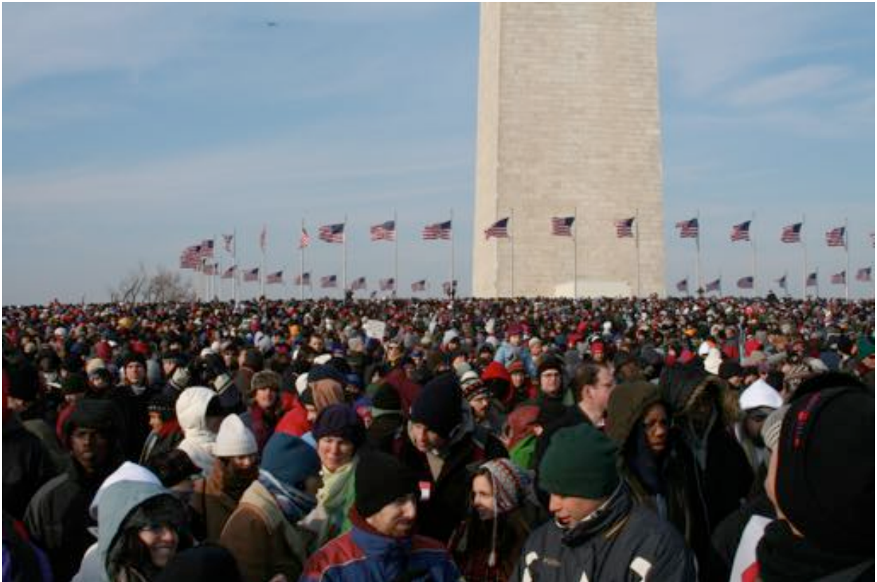
Hundreds of thousands gather on the Washington Monument grounds during the Presidential Inauguration, January 20, 2009