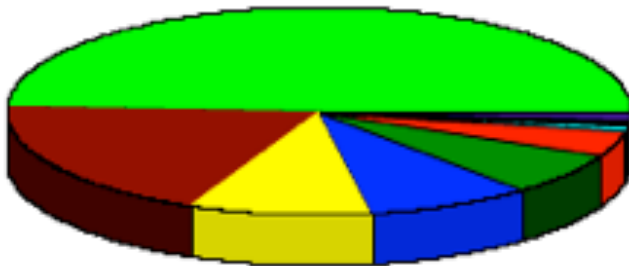
Categories as a % of total expenses

Individual donor and foundation support provided 88% of 2009 income.