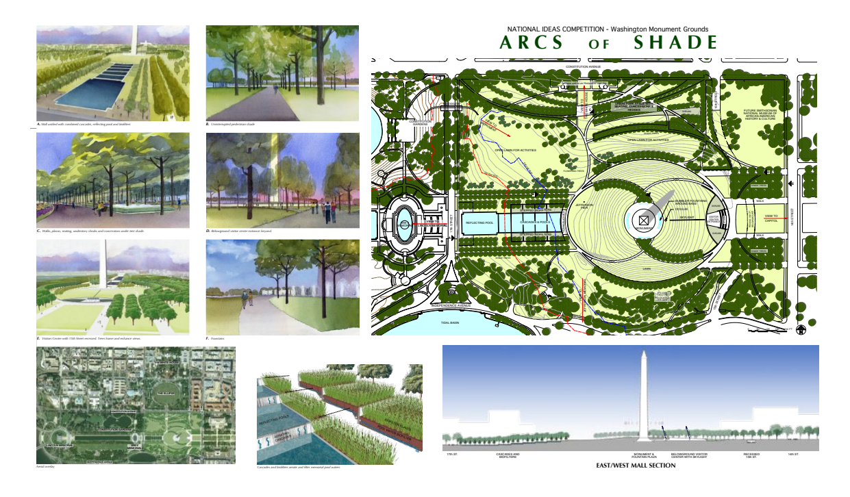
Arcs of Shade by Stephen Lederach

To see all the 24 semifinalists and 6 winners, visit <a href="http://www.wamocompetition.org">http://www.wamocompetition.org</a>.