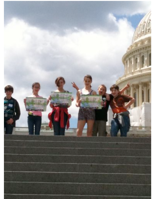
6 th graders at the U.S. Capitol with our Mall map

Our free Mall map and historical guide, National Mall: Stage For Our Democracy , continues to be popular with local residents, school groups, tourists, and Congressional offices. You can pick up a copy at Dulles Airport, Ronald Reagan Washington National Airport, the USDA Visitor Center at 14 th St and Constitution Avenue on the Mall, and, starting this year, at the downtown offices of the Washington Architectural Foundation and DC Chapter of the American Institute of Architects at 421 7 th Street, NW.