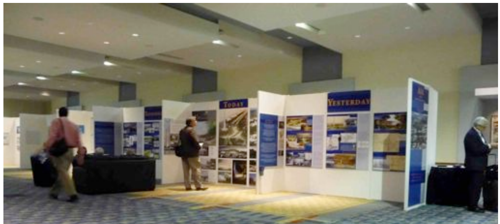
Yesterday, Today, and Tomorrow exhibition at the AIA Annual Meeting at the DC Convention Center

In creating the exhibitions, we began by asking “How can we ensure that future change is not ad hoc but is part of a coherent design vision?” How can we reinvent for our own time the historic legacy of the visionary 1791 L’Enfant Plan and 1901 McMillan Plan for Washington?